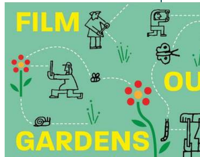
An Audio-Visual Pollinator Project

We continue to be active members of the Scottish Borders Food Growers Network and a wide range of local and national groups.